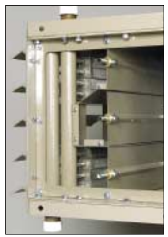
Maximum freeze protection