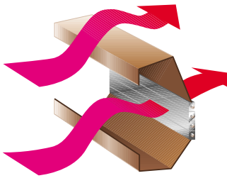
As outside air temperature rises, damper position modulates to allow some bypass air